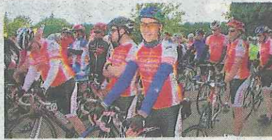
Crystal Palace footballer Geoff Thomas. He was diagnosed with chronic myeloid leukaemia in 2003 but made a full recovery after treatment.

Brewin Dolphin sponsored the Leukaemia and Lymphoma Research team headed by former England and